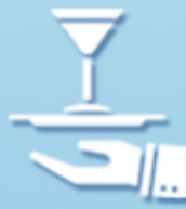
BAR, LOUNGE, INN, TAVERN OR SALOON