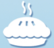
CAFÉ OR BAKERY