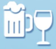
BREWPUB, TAPROOM, OR TASTING ROOM